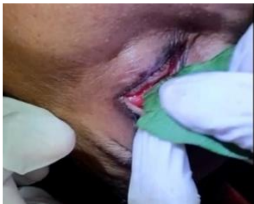
(Vartma Pradesse Prachhna karma with Parijat partra